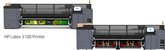
HP Latex 3100 Printer